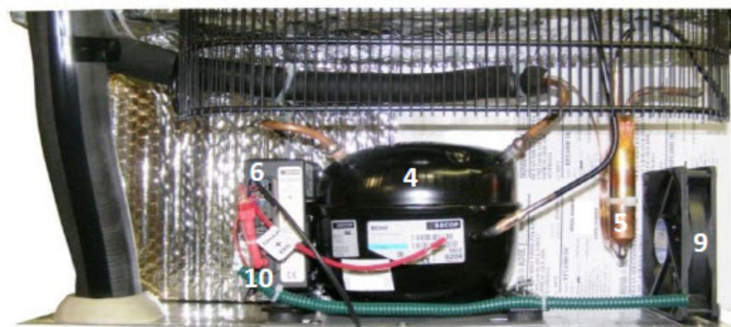
Base Expanded View